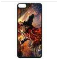
Prototype 2 iPhone 5C