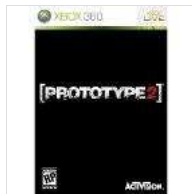
Prototype 2 (Xbox 360)