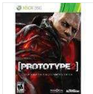
Prototype 2 Blackwatch Collector's...