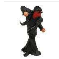
The Amazing SpiderMan Movie Prototype...